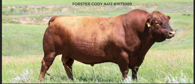
FORSTER CODY A412 #1673089