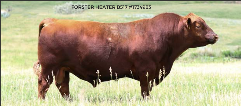
FORSTER HEATER B517 #1734983