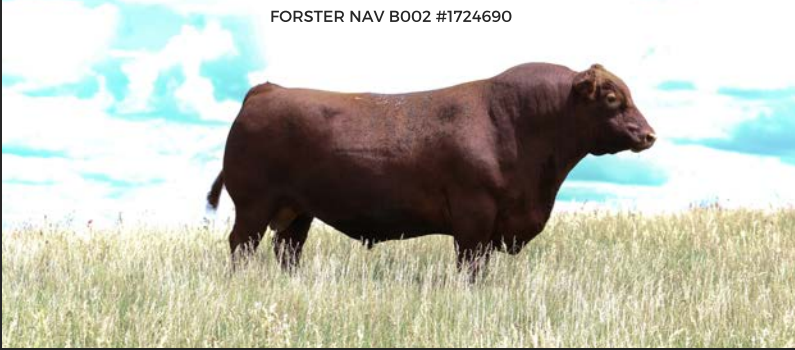
FORSTER NAV B002 #1724690