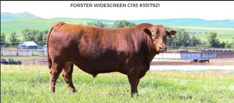
FORSTER WIDESCREEN C193 #3517921