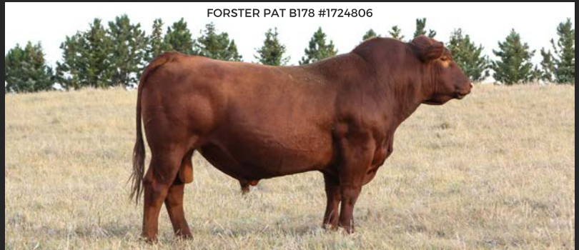
FORSTER PAT B178 #1724806