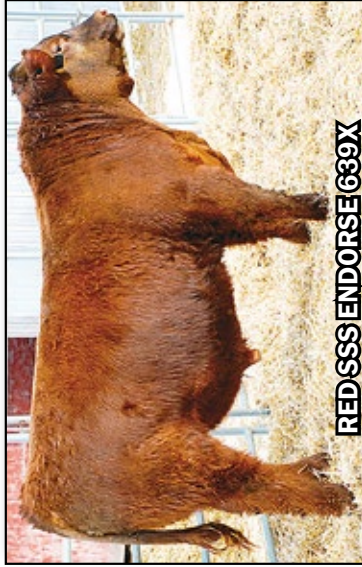
RED SSS ENDORSE 639X