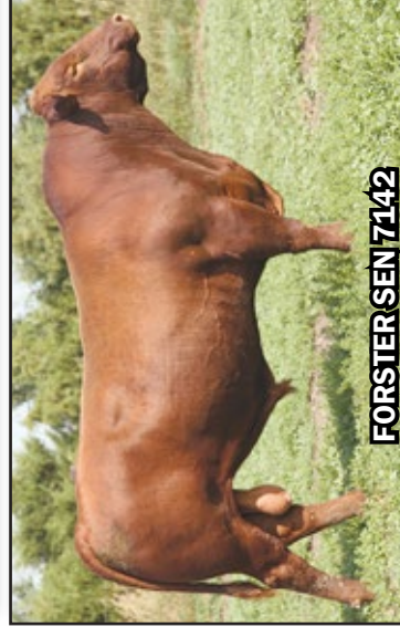
FORSTER SEN 7142

See videos of sale cattle on our website: